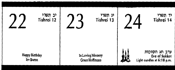
Sample calendar date space

Include business card, camera-ready ad or print the text of your message below. If necessary, type ad on a separate paper. For Anniversary, Birthdays, or Yahrzeit, please include name of person & Hebrew or civil date of occasion.